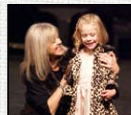
Clockwise, from top left: FOCUS on Fashion, Zoo Day, Holiday Party with Santa, MVP Valentine's Party, Six Flags Day, MVP Party